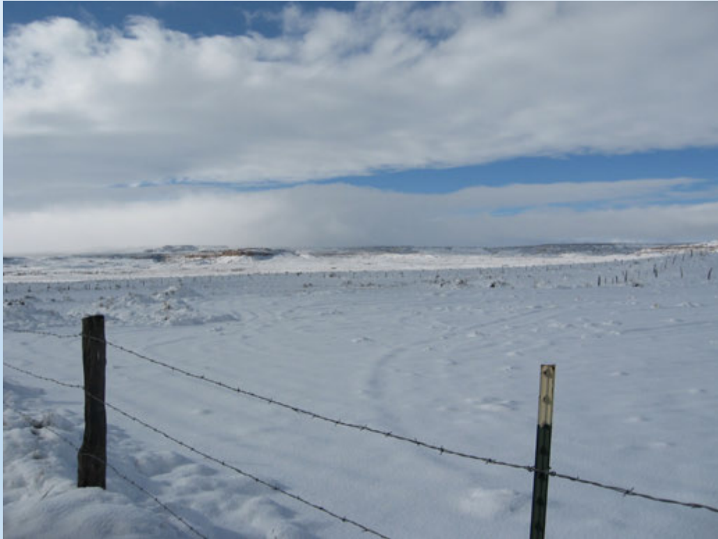
Amount of Snowfall